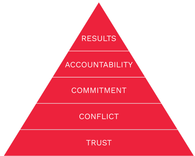
The Five Behaviors model

Since first leading Acclity’s Global Clinical Affairs department through their initial Five Behaviors session, both of the original facilitators have stayed close to the group by continuously checking in, helping the department integrate new members into the team, and conducting follow-up sessions in between. In August 2019, they decided to initiate another Progress Report in order to compare results against the 2018 findings. When the results of the newly-unveiled progress report displayed an all-green triangle (signifying that the department achieved substantial improvement), everyone celebrated.